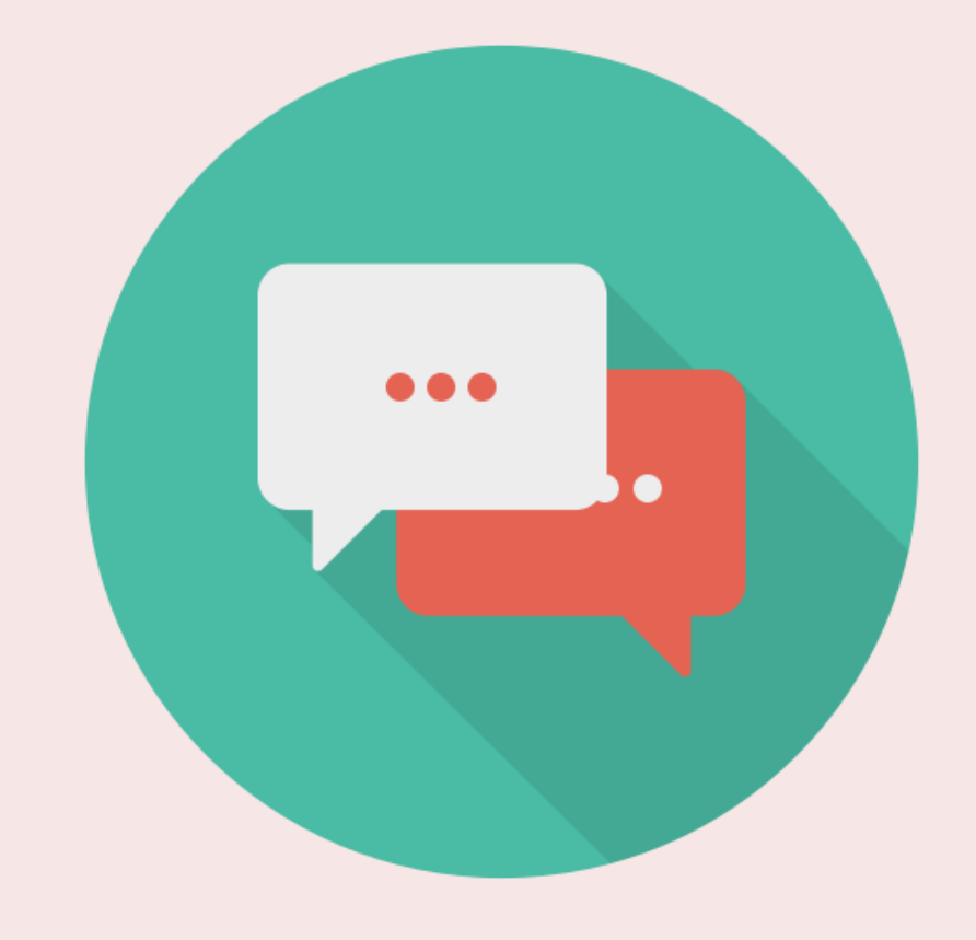
Learning English by Speaking