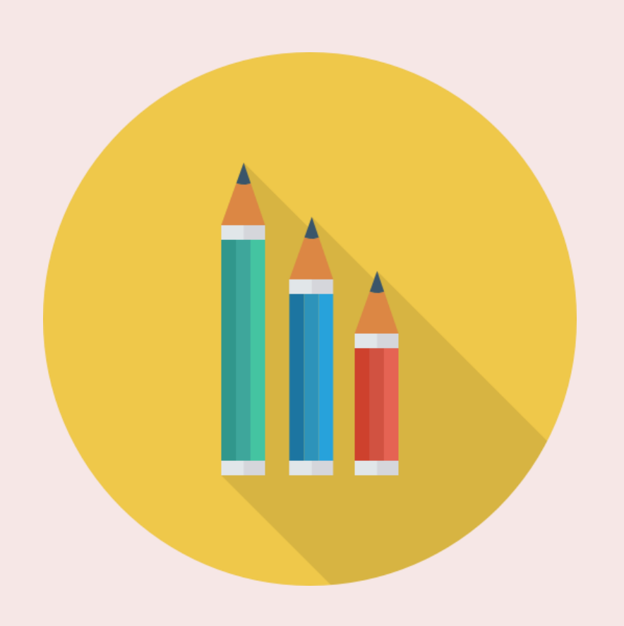
Lessons for Your English Level