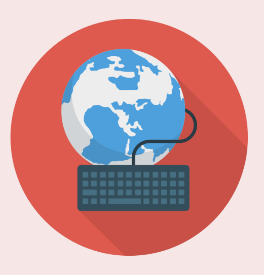
Uninterrupted Online Lessons