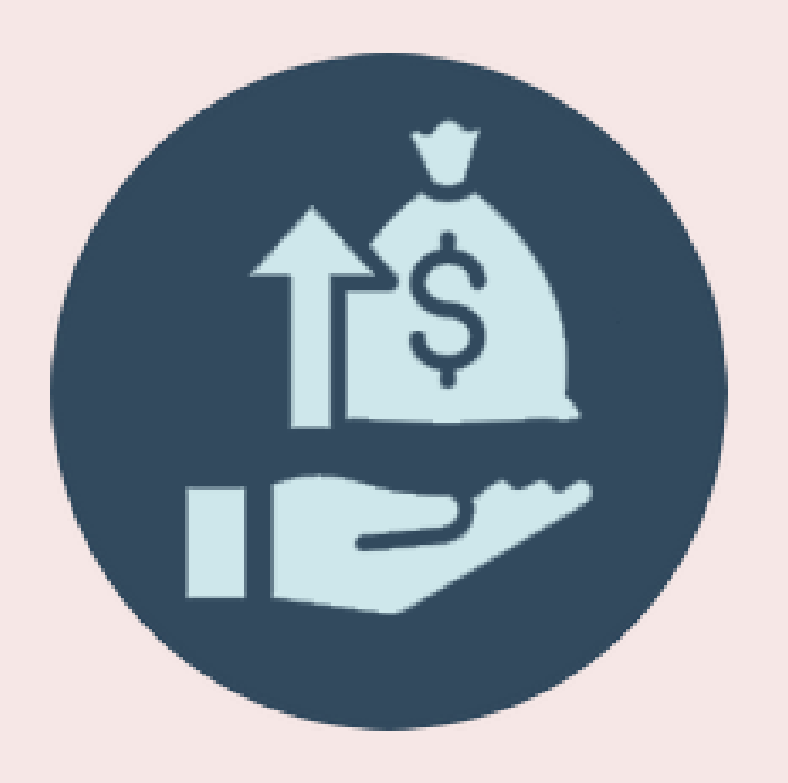
Time and Cost Savings